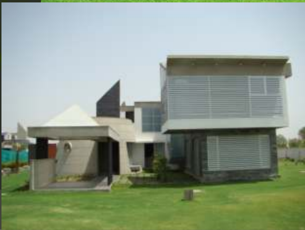
High-end Farmhouse with Swimming Pool